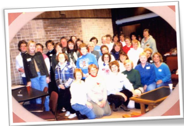
The Stitching Sisters Quilt Guild formed in January 2004 and originally met at Luther Bible Camp in Chetek.

Check out some of the activities that the Stitching Sisters Quilt Guild hosts during the year on the following page.